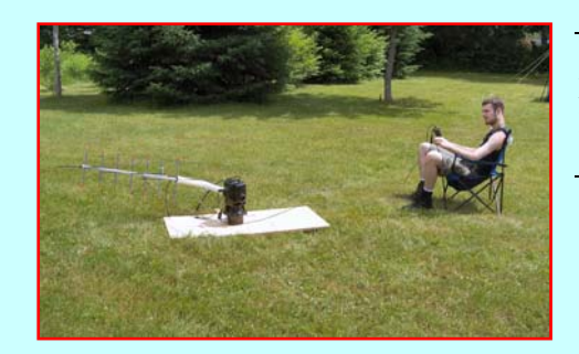
KB1NWU, Nathan Looking for the birds