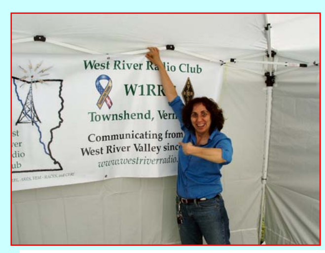
KB1OQG, Gaila - "Get that Banner straight."