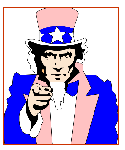
WE WANT YOU We're looking forward to seeing you at our next club meeting, or event.