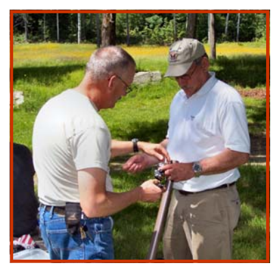
KA1ZQX—N1TOX Another 4 hand operation