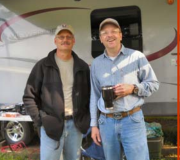
N1XSS—And how did you say you wanted your eggs?