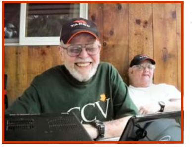
KA1ZQX K1JON Get that Bug outta there