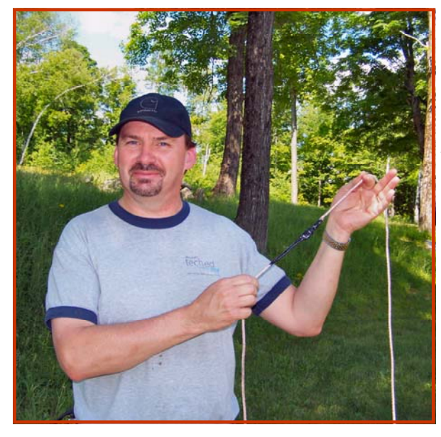
I did it ALL by MYSELF