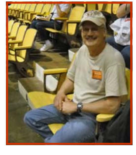
JA8LWU (W2JA) K1KU KA1ZQX

Our friends from JA Land After Dinner out