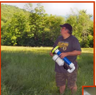
K1JON—Where did that ^*)$#^& tennis ball go?