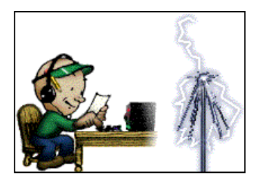
CUL es 73 de K1KU SK