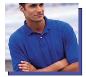
Outerbanks 60/40 Jersey Shirt

Colors Butter/Navy Trim, White/Navy Trim, or Stone/Navy Trim